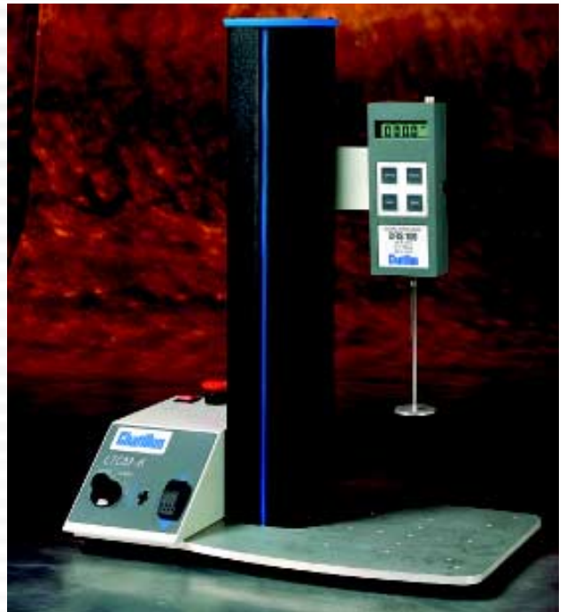
DFIS with LTCM-6 Series Motorized Test Stand

SPECIFICATION SS-FM-3112-0101 December 2000